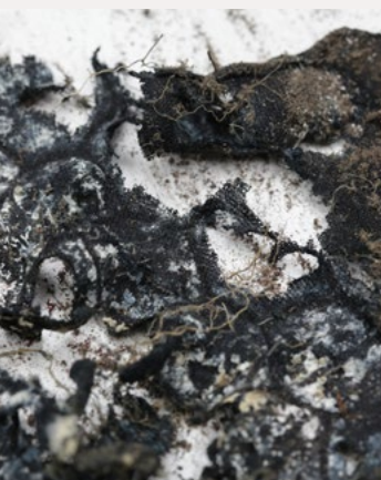
After being buried for six months, the nylon jersey fabric (left) remains relatively unchanged, whereas the wool jersey fabric (right) has significantly biodegraded.